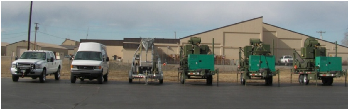
Components of a typical Joint Deployable Electronic Warfare Range consists of a command, control, and communication vehicle; a portable communication network; and various UMTEs.

Customers may select any number of UMTE threats and specific threat types that meet specific training requirements. Each C3 vehicle can control multiple UMTEs simultaneously, and any number of UMTEs can be networked together to provide a robust training environment.