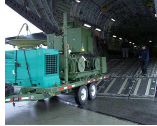
An entire JDEWR with all of its components can be transported anywhere via a single Boeing C-17.