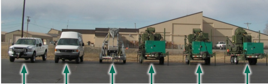
Customer provided 1/2 ton pickup or equivalent